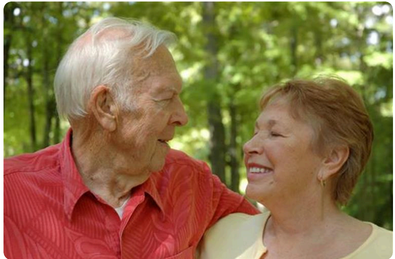
The love they shared 'til the end