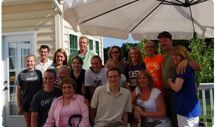
most of the family