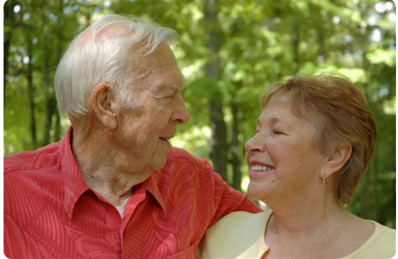
The love they shared 'til the end