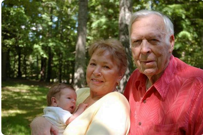
The last grandchild born, #18