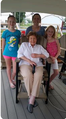
went out for ice cream