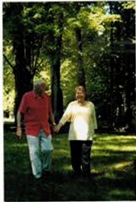
Walk in Peace, my dear